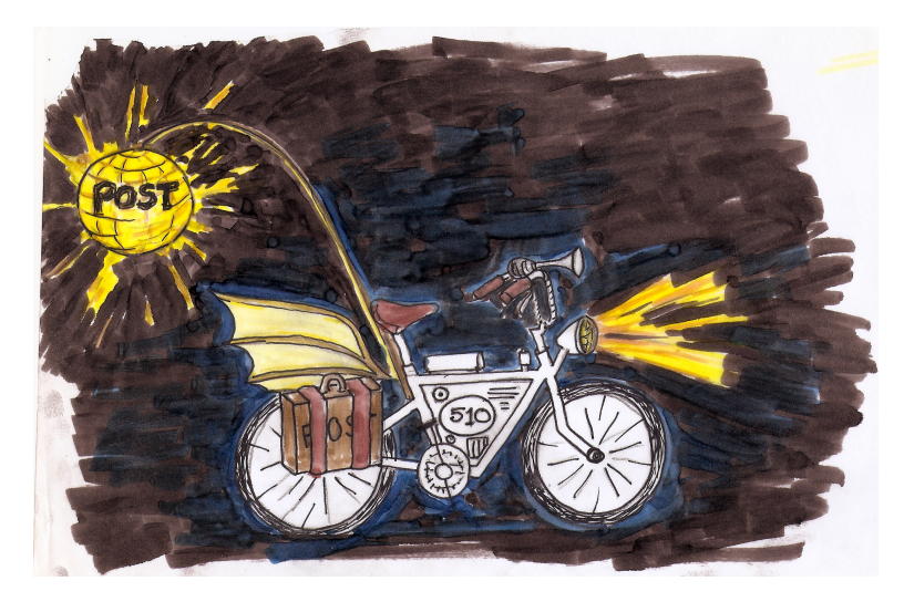
Bike design concept sketch. (Head light, wing decoration, horn, briefcase, and lantern)