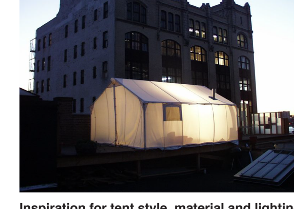
Inspiration for tent style, material and lighting.