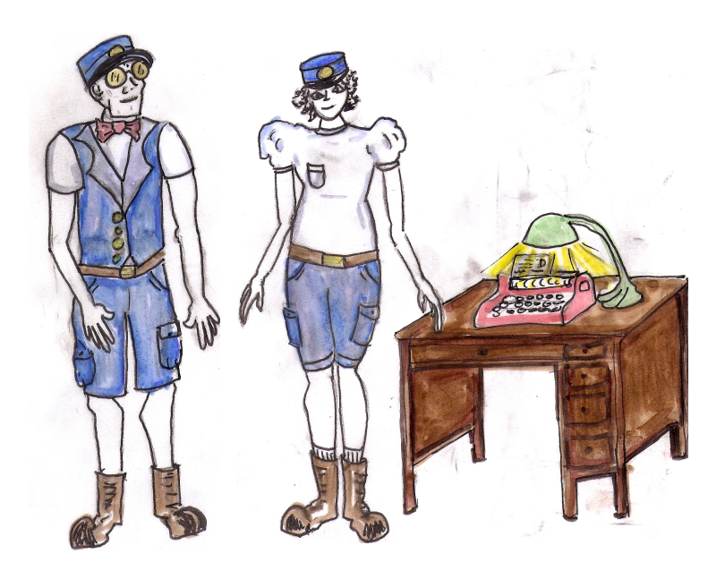
Postmaster/typist costume concept sketch with desk, typewriter and desk lamp