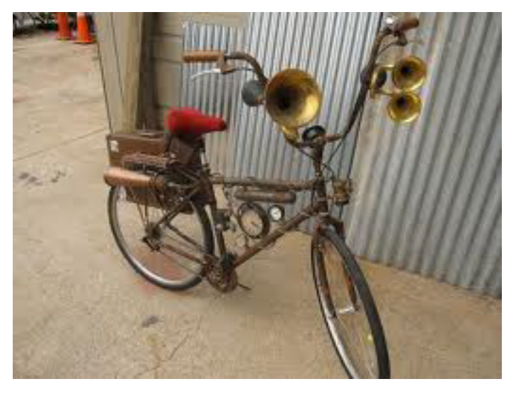
Inspiration for bike style, decorations and lighting.